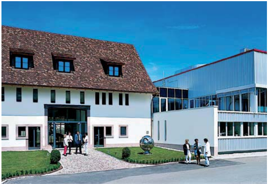
Technology Center at Binzen

Only Glatt can offer you this unparalleled scope of services - at the ground-breaking Technology Center in Binzen. Profit from the comprehensive range of services offered by this innovative high-tech center which possesses the necessary technologies and expertise. This guarantees the speedy launch of your products onto the market!