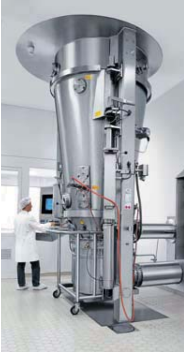
Fluid Bed Process in a GPCG 60 Pilot Machine