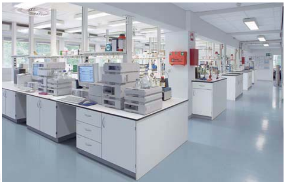
Quality Control Laboratory