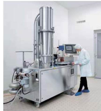
GPCG 3 - Laboratory Fluid Bed Machine for Small / Development Batches

As well as taking a lead in expertise, there is also a major time bonus. With Glatt, major development phases can be significantly reduced. We know your product and your project, so we can offer you the time bonus, backed up with the comforting assurance that the proven process will also function at production scale.