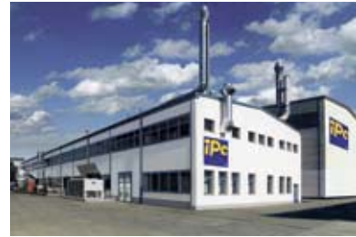
IPC Process Center GmbH, Dresden